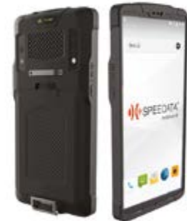
back and front side of the SD60