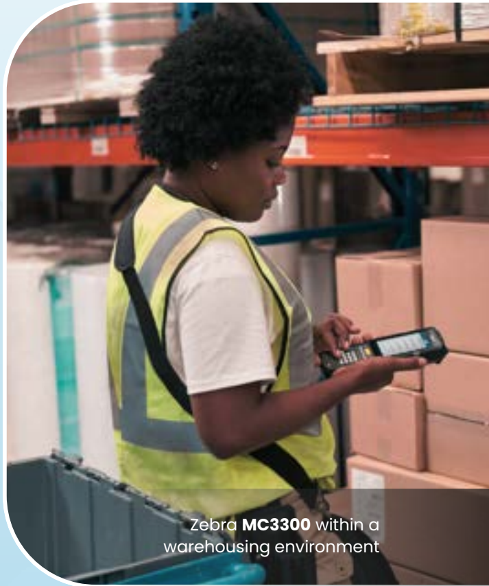
Zebra MC3300 within a warehousing environment