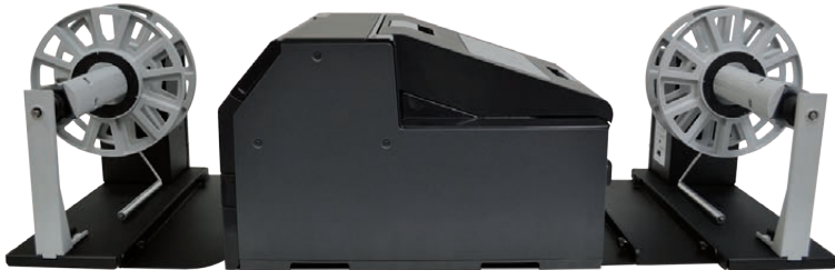
Epson C6500A printer - LABEL UNWINDER (UW6500P) - LABEL REWINDER (RW6500P) (Not included)

The Roll to Roll system specifically designed for Epson C6000A / C6500A color label printer can handle rolls up to 220mm (8.66") media wide and having an outside diameter up to 250mm (10"). Both Unwinder and Rewinder are equipped with a fixed 3" core holder.