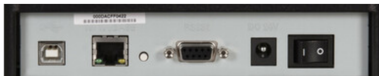
Ethernet LAN, USB and Serial interfaces as standard