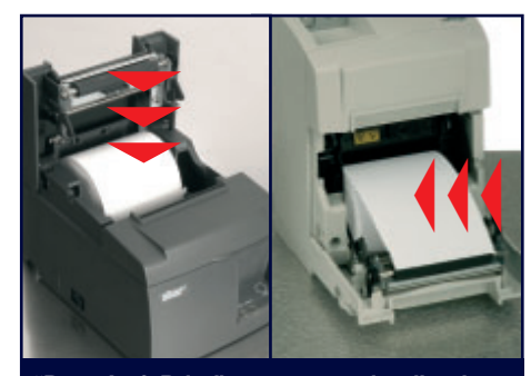
"Drop-In & Print", easy paper loading in either the standard horizontal or space saving vertical position