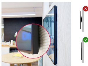
Zero-Gap Wall Mount

Designed to perform in continual, around the clock environments, the LH5570UHB can be installed and utilised in landscape and portrait orientation. The jaw dropping and best-in-class 35mm total depth (when used with the included proprietary brackets) will mean this display can be installed discreetly and elegantly in all areas.