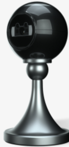
FR50 Pearl stationary scanners