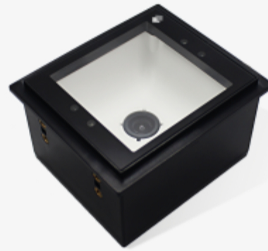
FM3080 Hind stationary scanners