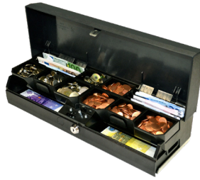
8 coin & 6 note (3+3 at rear) 2 note/media storage underneath