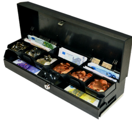
6 coin & 5 note (2+1+2 at rear) 2 note/media storage underneath