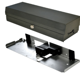
Cassette & Baseplate