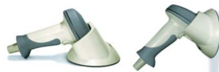
1100/1105 & 1200 Cradle Can be used on tabletop or wall mounted