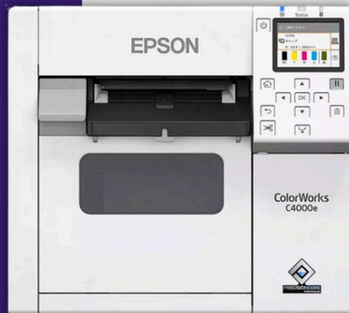
ColorWorks C4000 Desktop Colour Label Printer

Since its launch in 2022, the C4000 has consistently proven to be the best product branding label printer for small businesses.